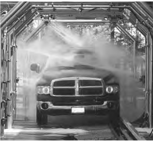
Five Star Auto Care's TunnelWatch system is one of many water-saving features employed by the car wash. The wash uses about half as much water as a typical home car wash.

The college's indoor facilities have been retrofitted in recent years with numerous low-flow fixtures, including 100 high-efficiency showerheads installed throughout the locker rooms and approximately 40 waterless men's urinals. Each new urinal saves an average of 40,000 gallons per year and the showerheads save 5,000 to 6,000 gallons of water per year, for a combined total savings of over 2 million gallons annually. The college would like to double that number in the next year. Sierra College draws its irrigation water for landscaping from a pond that's fed by the Placer County Water Agency's (PCWA) Boardman Canal, allowing it to avoid impacting the treated water supply for irrigation.