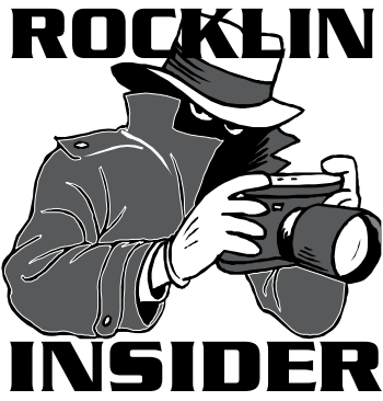
Highlighting news of Chamber members and the community. Send submissions to info@RocklinChamber.com.

See page 7 for a complete listing of board members.