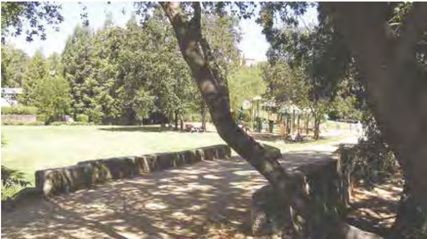
Clover Valley Park is one of the many parks and open spaces that help keep the City of Rocklin on the top of lists as one of America's best cities.

The recent recognition is not a first for Rocklin, which has been named a top city before. In 2010, Rocklin was listed as one of